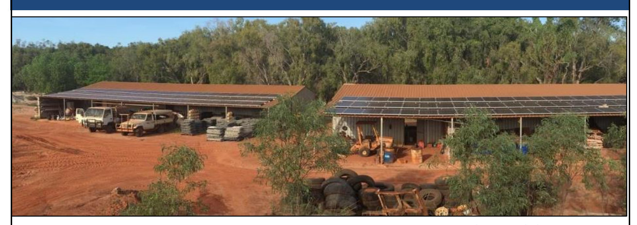
Solar Energy!