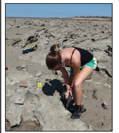
Rock Oyster Maintenance

In early 2016, KMRS began two monitoring programs: coral bleaching and rock oyster spat recruitment & competition. Both programs will be continued into 2017 and for future years to come! So far, the coral pools have seen a reduction in macroalgae cover and experienced a large accumulation of silt. The rock oyster spat seem to prefer settling on the middle shore of Cygnet Bay's