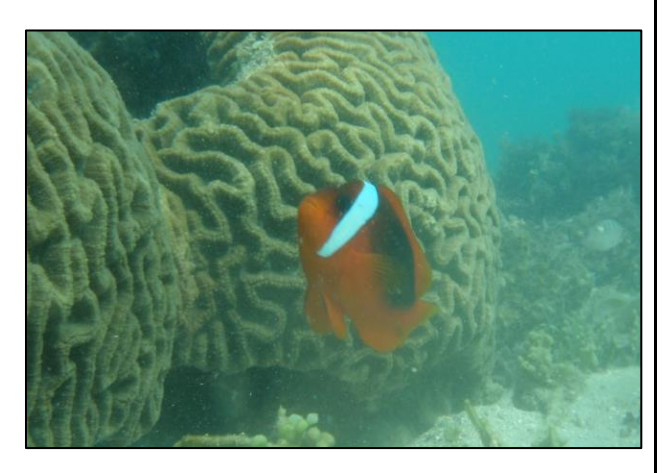
Anemone fish.

Many researchers utilized the KMRS's laboratory this year as a base for their continuing studies on the Kimberley coast. During 2016, scientists from the Australian Institute of Marine Science and the University of Western Australia came to study a range of topics from fish recruitment and turtle tagging to coral bleaching. If you are a research scientist or a post-graduate student looking for a unique area to conduct your work, contact the KMRS team to see what we can do for you.