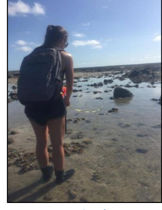
Coral Transect

intertidal coastline. Throughout the year, innovative KMRS interns have proposed extensions to these projects in hopes of implementation in 2017.