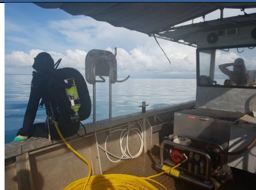
Uli diving & Liam tendering

This wet season has been particularly harsh and caused quite a bit of damage to the infrastructure of the pearl farm. The pearling crew have been hard at work making repairs to the farm while maintaining regular pearling duties. However, the cyclones have forced them to pull the boats off the water, sometimes for several days, adding to the difficulty. Yet, their hard work and dedication has paid off and repairs to the farm are finished allowing them to prepare for the upcoming X-ray of the oysters.