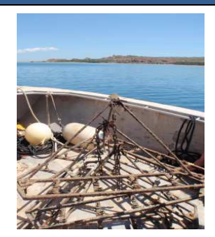
Coral recruitment frames collected from Sunday Island.

Coral Recruitment Project: KMRS interns have collected multi-tile recruitment frames used previously by WAMSI. The frames provide an opportunity to broaden ongoing coral transect monitoring to assess the recruitment of juvenile coral polyps. This will help increase the scope of reef health evaluations here at KMRS. KMRS will use the frames to target different subtidal and intertidal coral populations at Cygnet Bay over the peak spawning period (March/April) next year.