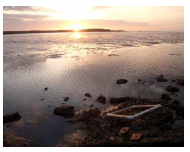
A beautiful morning counting rock oysters

Rock Oyster Projects: KMRS is all about oysters these days, with three different rock oyster projects on the go. The interns have been busy collecting monthly data for the KMRS monitoring project (now 2 years in); and for UWA Masters students Ash and Andy. Some spat (juvenile oysters) have been recorded in Ash's quadrats, and Andy's oyster spat recruitment tiles have been holding up well in the elements. It will be really interesting to see what results they find over the next few months as the onset of the wet season typically marks the start of the rock oyster spawning period.